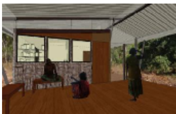
YIRRKALA WAITING AREA MONTAGE

Plans for the Centre have suffered a long course of delay after the Federal Government Intervention into Aboriginal communities in the NT & the necessity to ascertain the legal situation regarding development in the area.