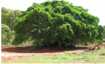
BANYON TREE SITE

Yirrkala has experienced a scourge of substance abuse & youth suicide that has risen to unprecedented levels, severely affecting the mental health of the Community. By 2007 the resulting stresses were so intolerable the Community took action.