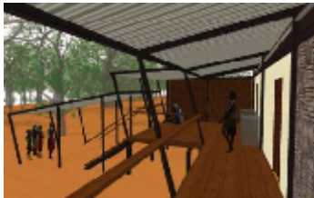
MEN'S SHARED SPACES MONTAGE

The ABF is helping raise the funds necessary to develop the Healing Centre at Yirrkala.