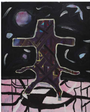
BRAT | Mad Hatter-doing the Plumbing | 51cm x 41cm | Oil on canvas

This love poem to blue whales by Jeffrey Samuels is a beautiful representation of his poetic soul. Regarded as one of the fathers of contemporary Aboriginal art, Jeffrey founded the Boomalli urban artists Centre in the 1980s alongside many famous contemporaries including Tracey Moffat, Bronwyn Bancroft, and Arone Meeks.