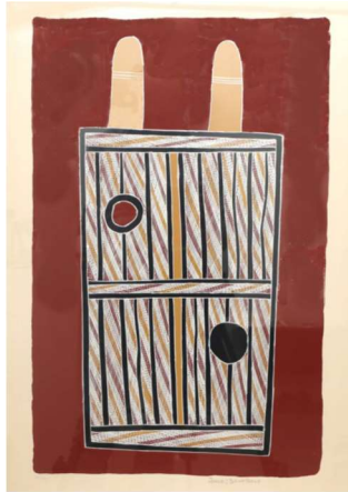
Johnny Bulun Bulun | Body Design- Djiibulyamorr Waterhole 27/75 | 64cm x 41cm | Screenprint Buff Magnani Paper, framed

The journey of women hunting together throughout the country is depicted in this work by a contemporary painter from the Larjamanu area of the Northern Territory desert. The women, depicted by U shapes here, have arrived at the ceremonial ground with the dancing area. The central cross marks reveal the dancing happening in four directions along the sand. Women sit around with their hair string belts (wiggly lines beside their coolamons and digging sticks (oval and stick shapes). In lines and swaying with feet apart the women jump in tight crocodile formation, one after the other, singing and dancing – swaying and moving in a pattern – as they imitate the movement of the ancestors from waterhole to waterhole thus ensuring the procreation of the species and fulfilling their obligation to maintain and care for their country.