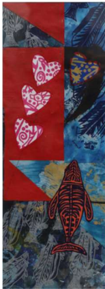
Jeffrey Samuels | Blue Whale 4Hearts | 51.5cm x 17cm | Mixed media on paper

In 1981, Tillers developed a system of painting in which multiple canvas board panels fit together to form large, gridded works and Metafisica Australe 2015 follows the same technique comprising 24 panels.