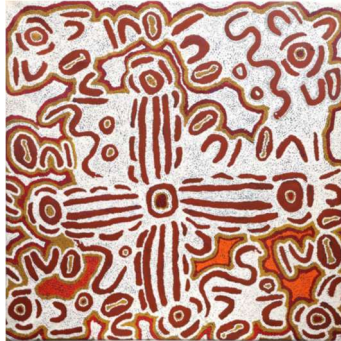
Liddy Nakamarra Nelson | Yumurpa | 113cm x 114cm | Polymer paint on canvas

The journey of women hunting together throughout the country is depicted in this work by a contemporary painter from the Larjamanu area of the Northern Territory desert. The women, depicted by U shapes here, have arrived at the ceremonial ground with the dancing area. The central cross marks reveal the dancing happening in four directions along the sand. Women sit around with their hair string belts (wiggly lines beside their coolamons and digging sticks (oval and stick shapes). In lines and swaying with feet apart the women jump in tight crocodile formation, one after the other, singing and dancing – swaying and moving in a pattern – as they imitate the movement of the ancestors from waterhole to waterhole thus ensuring the procreation of the species and fulfilling their obligation to maintain and care for their country.