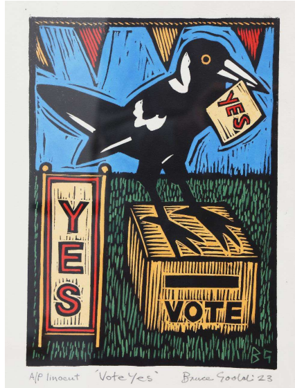
Bruce Goold | Vote YES 2023 | 33.5cm x 24cm | Artist proof linocut

Bruce Goold is a highly respected and renowned Australian artist whose work covers a diverse range of interests and influences and has asserted its own unmistakable influences on Australian contemporary art and design.